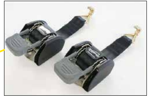
THE KARGO MASTER UTILITY ECONO VAN CARGO RACK IS AVAILABLE WITH 2 OR 3 CROSSBARS (See inside back cover for Retractable Ratchet Straps detail – #40850 – Shown on image to left – included With #40825)

The Kargo Master all-purpose Utility Econo Van Rack is designed to be stronger than other ordinary van racks in the market. The Utility Van Rack is constructed using heavy duty 1.75" square tubes, and it is available in 2 or 3 steel cross bars. Strong wide mounting feet clamps secure the rack to rain gutter to provide maximum support, stability and offer easy, no-drill installation for your van. Feet clamps are coated to protect rain gutter paint. Ladder stops are included in the van rack package and they provide great convenience when securing your loads. All Kargo Master Van Racks are coated with zinc primer and thick marine grade powder coat to provide excellent corrosion resistance.